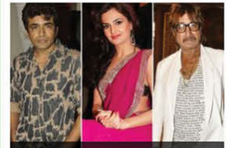
Bigg Boss: Inmates with Criminal Record