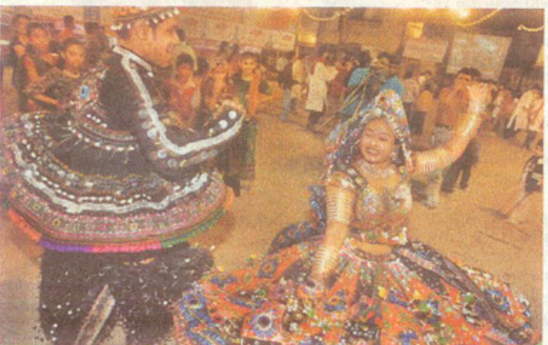
The first day of Navratri was celebrated with gusto all over Mumbai on Saturday. While some performed the garba at the Kora Kendra in Borivali (top right), a few others did the same at the Dr Antonio da Silva High School's Grounds in Dadar