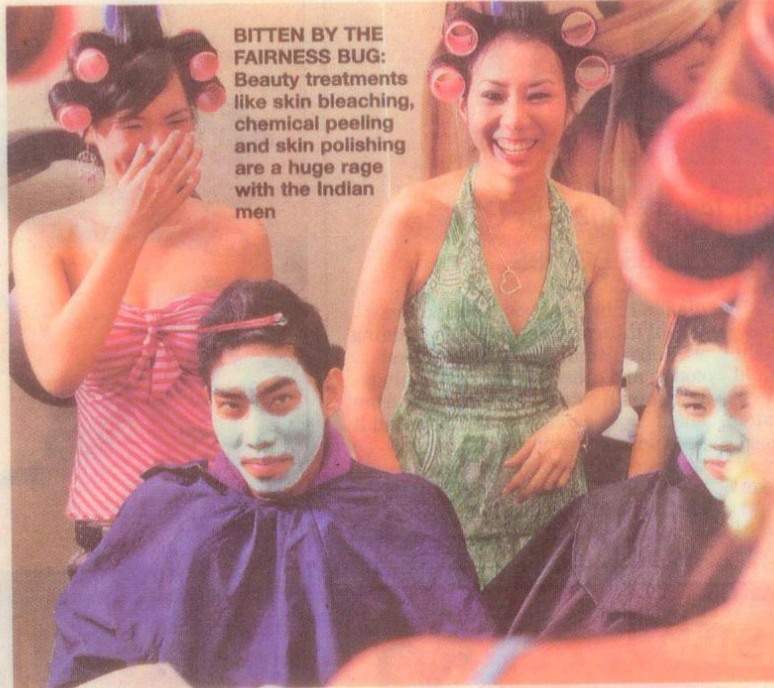
BITTEN BY THE FAIRNESS BUG: Beauty treatments like skin bleaching, chemical peeling and skin polishing are a huge rage with the Indian men

As renowned make-up artist Cory Walla puts it, "Fairness creams are the single largest selling cosmetic products in the country. Indians are